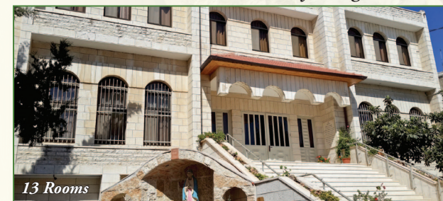
Charles de Foucauld Pilgrim's Hostel. Latin Church. Tel/fax: +972 2 289 9364 / Email: visittaybeh@gmail.com