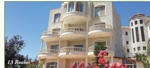
Beit Afram Guest House. Road to Ramoon Village. Tel. +972 2 289 8572 / Email: visittaybeh@gmail.com