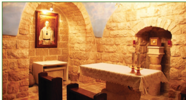
House of Charles de Foucauld